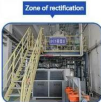
Zone of rectification